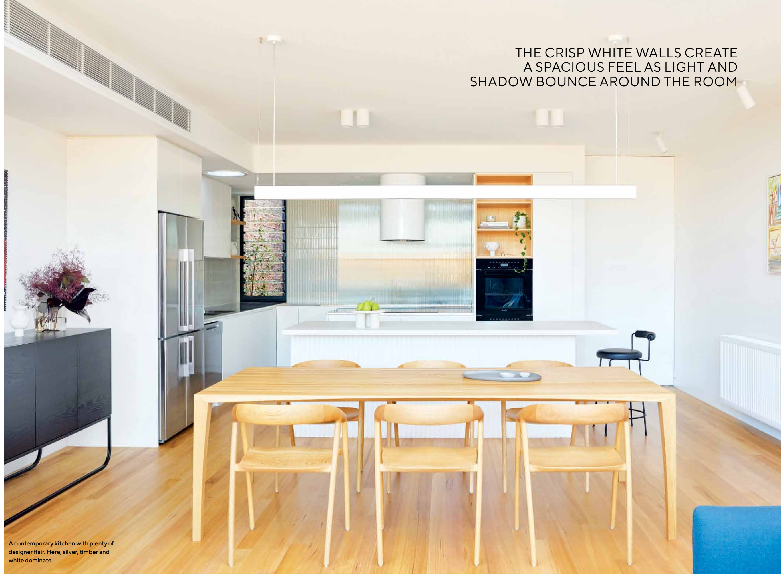
A contemporary kitchen with plenty of designer flair. Here, silver, timber and white dominate

THE CRISP WHITE WALLS CREATE A SPACIOUS FEEL AS LIGHT AND SHADOW BOUNCE AROUND THE ROOM