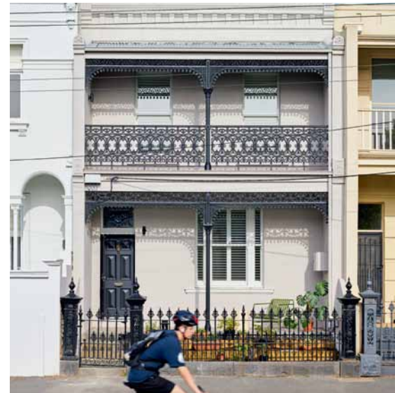
LEFT From the front, the home looks like a traditional Victorian terrace